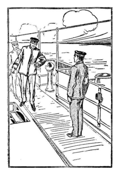
"You Are Not Likely to Be of Any Use Here."