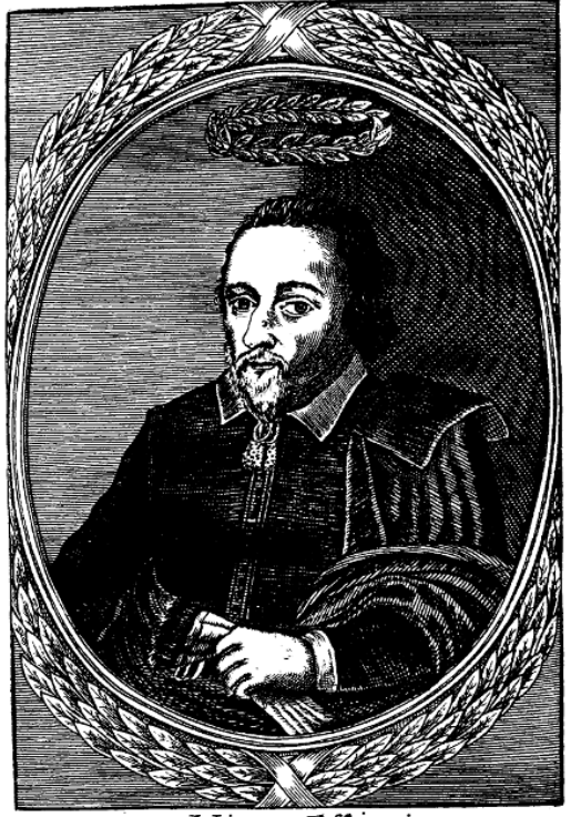
Vera ac Viva Effigies PHILIPPI MASSINGER. Gen